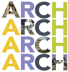
EXHIBIT A A Regional Coalition for Housing

Celebrating 30 years of bringing cities together to house East King County