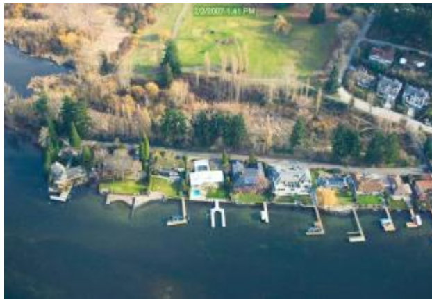
Piers near Juanita Bay