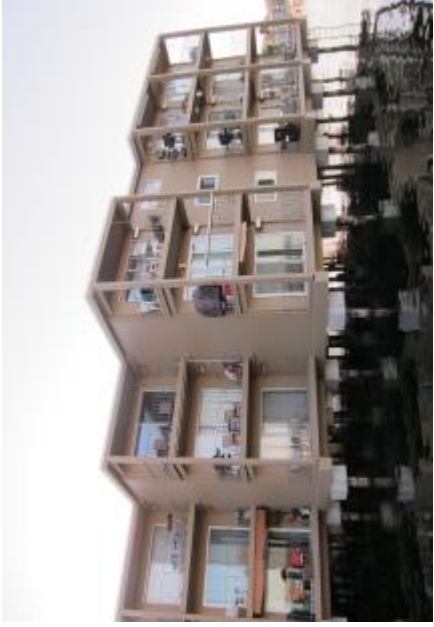
Overwater residences on the lake

Policy SA-6.2: New overwater residences are not a preferred use and shall not be permitted. Existing nonconforming overwater residential structures should not be enlarged or expanded.