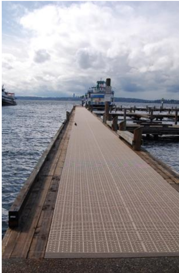
Marina Park pier with grated decking

Policy SA-20.1: Incorporate salmon-friendly pier design for new or renovated piers and environmentally friendly methods of maintaining docks in its shoreline parks.