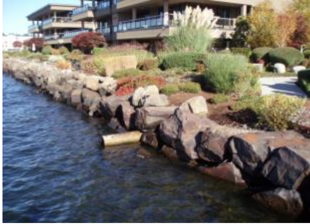
Bulkheads along the lake

Lake Washington is an important migration and rearing area for juvenile Chinook salmon. The juvenile Chinook salmon using the lake depend on the following habitat characteristics: