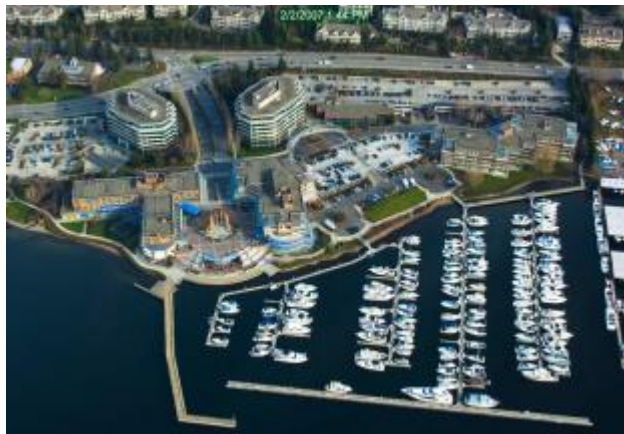
Carillon Point Marina

Policy SA-1.3: Maintain existing and foster new uses that are dependent upon or have a more direct relationship with the shoreline and Lake Washington.