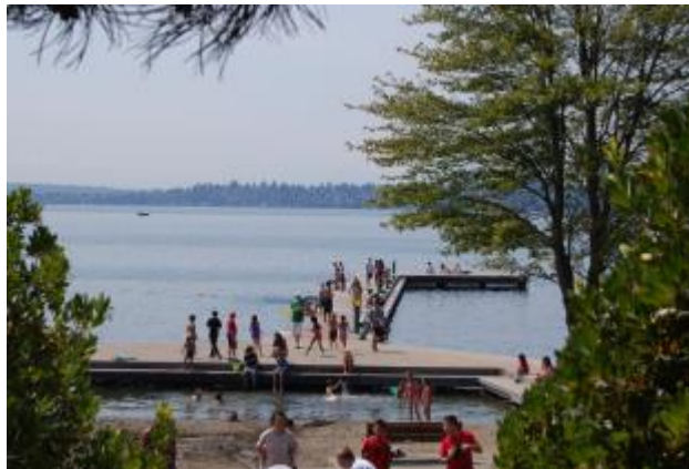
Houghton Beach Park

With miles of shoreline, the City has preserved significant portions of its waterfront in public ownership as parks. Kirkland's waterfront parks are the heart and soul of the City's park system. They bring identity and character to the park system and contribute significantly to Kirkland's charm and quality of life. The 14 waterfront parks stretch from the Yarrow Bay wetlands to the south to Juanita Bay, Juanita Beach and O. O. Denny Parks to the north, providing Kirkland residents year-round waterfront access. Kirkland's waterfront parks are unique because they provide citizens a diversity of waterfront experiences for different tastes and preferences. Park activities and facilities include public docks and fishing access, boat moorage, boat launches, swimming, interpretative trails, and picnicking. Citizens can enjoy the passive and natural surroundings of Juanita Bay and Kiwanis Parks and the more active swimming and sunbathing areas of Houghton and Waverly Beach Parks.