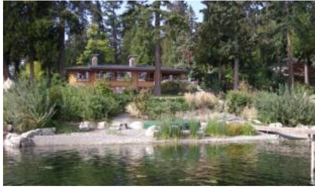
Soft shoreline restoration with native vegetation along the lake

Policy SA-10.8: Locate and design new development to eliminate the need for new shoreline modification or stabilization.