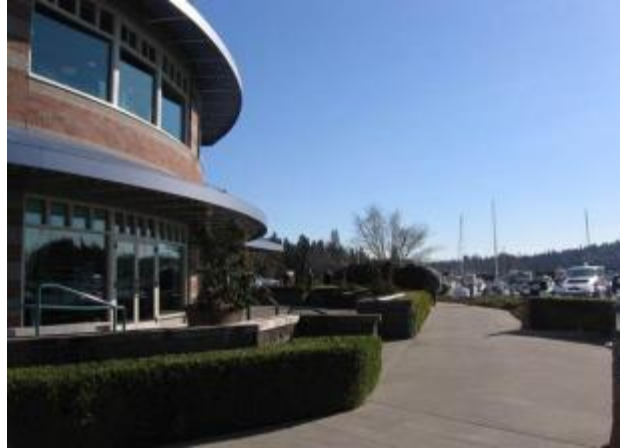
Public access at Carillon Point

Carillon Point is a vibrant mixed-use development that contains office space, restaurants, and retail space in addition to a hotel, day spa and marina facilities. The site has been designed to provide both visual and physical access to the shoreline, including expansive view corridors which provide a visual linkage from Lake Washington Boulevard NE to the lake, as well as an internal pedestrian walkway system and outdoor plazas. The Central Plaza of Carillon Point is frequently used for public gatherings and events. The Plaza is encompassed by a promenade and Carillon Point's commercial uses. If new development or redevelopment occurs on this site, existing amenities related to public access, use and visual access to the lake should be preserved.